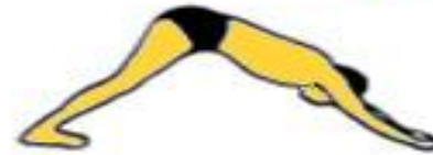
8. Oṃ! Marīcaye Namaḥ