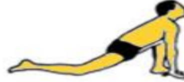
4. Oṃ! Bhānave Namaḥ