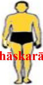
1. Oṃ! Mitraya Namaḥ