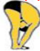
3. Oṃ! Suryāya Namaḥ